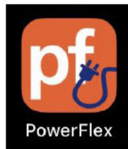
Figure 2. PowerFlex app icon