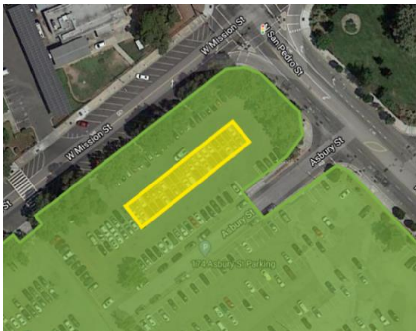
Figure 1. Employee Parking for All Types of Vehicles (green) Electric Vehicle Charging Stations (yellow)

The City of San Jose installed 42 Electric Vehicle Charging Stations in the secured employee parking lot located at the southwest corner of W. Mission Street and N. San Pedro Street (Fig. 1).